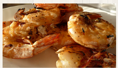
*FIRE GRILLED GARLIC SHRIMP 10.95*

May substitute any munchies with * for only 1.00 All Selections include Fries except for Chili Lime Chicken and Shrimp